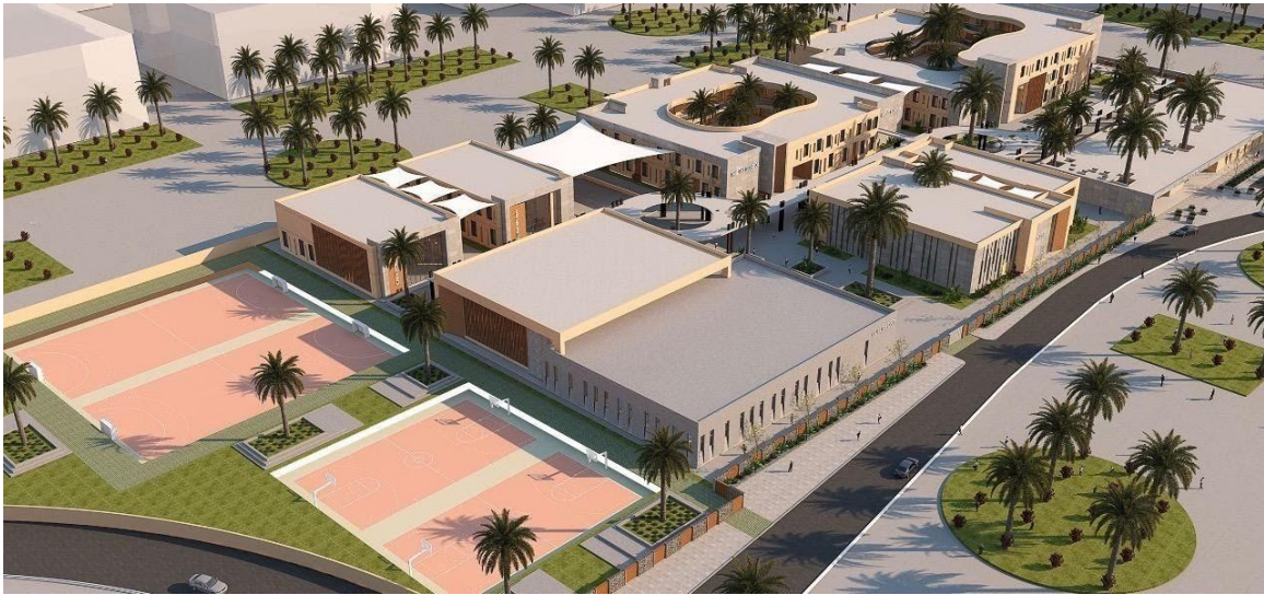
ASB future campus adjacent to UM6P